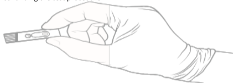
Figure 2. View of MIOXSYS